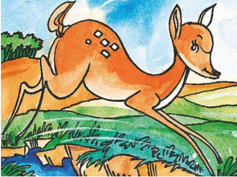
Talaksu e'na sapa'.