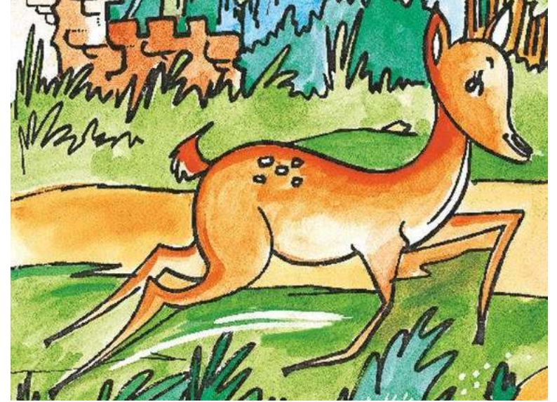
Talabay e'na ād alarak.